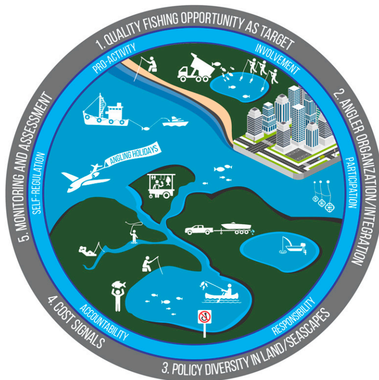
Fig. 2. There are five essential tenets of policy reform for sustainable recreational fisheries (outer ring). And there are several supposed impacts on angler and manager incentives (inner ring). Recreational fisheries are quite diverse in terms of their motives, habitats, and impacts (center image).

Second, anglers must be better organized and involved in management processes. Although governance systems for recreational fisheries are in place in many developed nations, even wealthy countries struggle to integrate recreational fisheries effectively into the fishery policy and assessment system. For example, the European Union continues to keep recreational